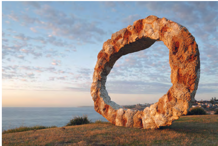
Every Spring, the Sculptures by the Sea event attracts thousands of visitors to the coastline exhibit on the walk from Bondi to Coogee.

Law student, University of Bergen, Norway