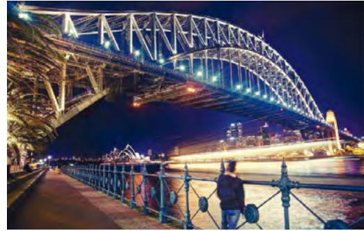
#iconicoz Instagram photo competition entry by Jessie, USA