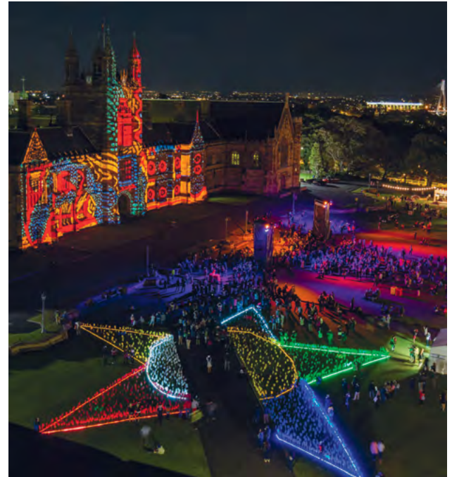
Vivid Lights at The University of Sydney